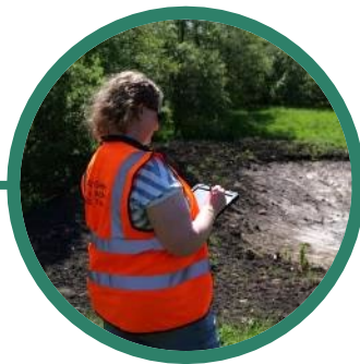
Site Survey & Feasibility