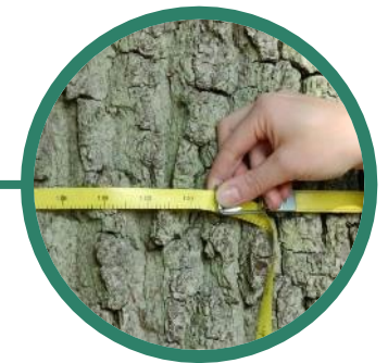
Monitoring & Evaluation