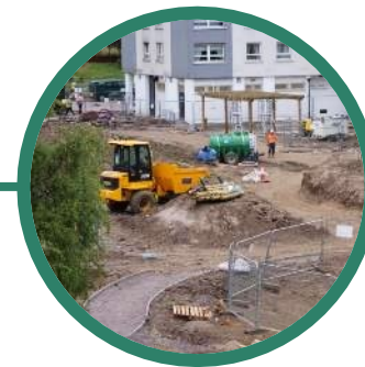
Project & Contract Management