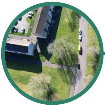
Pre-Project Consultation & Advice

We deliver environmental solutions that include greenspace enhancement; woodland creation and management; transforming vacant and derelict land; green active travel; sustainable water management; and improving habitat and biodiversity. We manage projects from inception to delivery, including the following key stages: